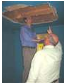
Bat infestation in Crowley County gym

Great Ed led a series of Colorado road trips so state legislators, state board of education members and other policymakers could see for themselves the shameful conditions many of our schoolchildren endure every day.