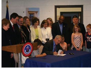
Governor Ritter signing B.E.S.T. into law. May 22, 2008